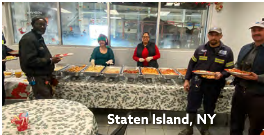
Staten Island, NY