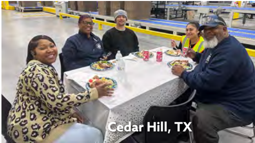
Cedar Hill, TX