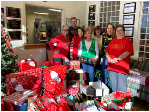
Pratt Statesville collected more than 50 gifts for local senior citizens as a part of their "Be a Santa to a Senior Holiday" program.