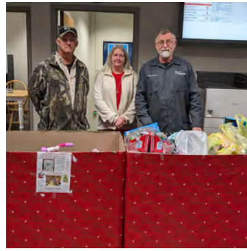
Humboldt, TN Corrugating collected toys for "A Lending Hand" toy drive with Safety Connections. This drive allows parents, grandparents, guardians and others to pick out toys for their kids during the holidays.

Employees from several divisions at our Conyers, GA campus came together to donate toys to Children's Healthcare of Atlanta.