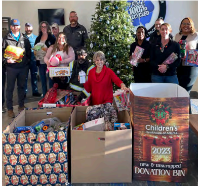
Raleigh Converting held its annual Christmas Tree Ornament Fundraiser to support Toys for Tots. Since 2018, the plant has raised over $4,000 for local organizations during the holidays.